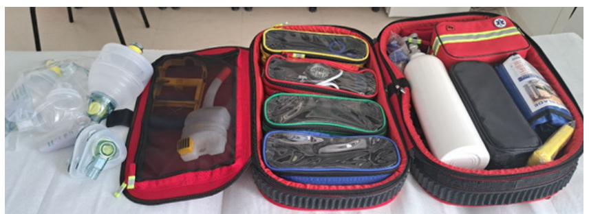
Life Saving Emergency Supplies donated 2022

Hitno is eagerly awaiting an Autoclave sterilizer that is on IMAS' list of priorities to donate next.